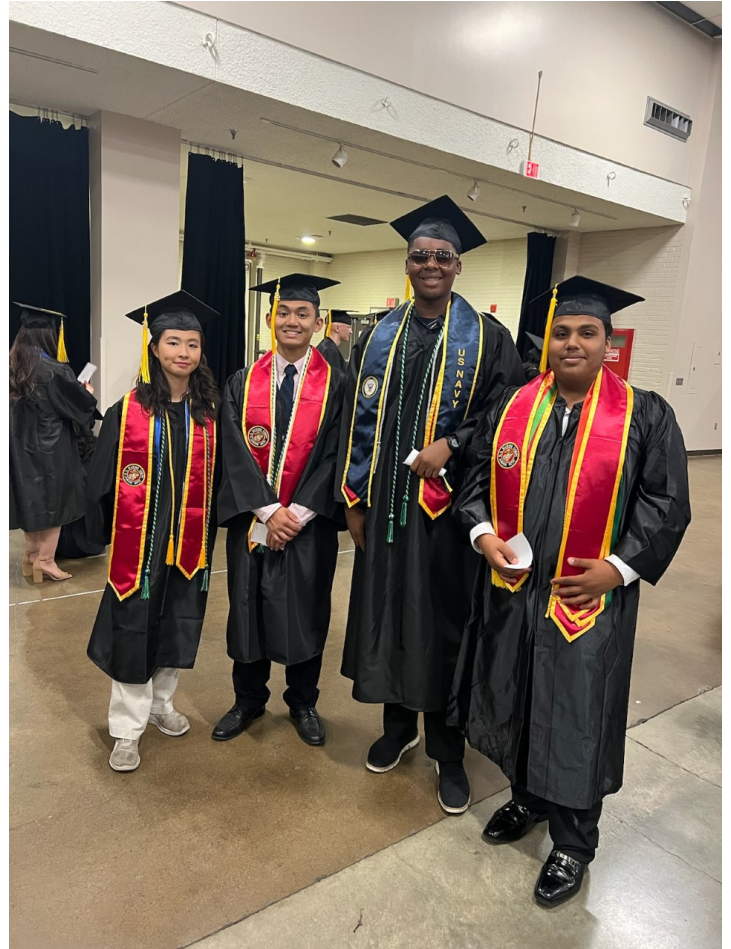
The MCJROTC cadets alongside the Como Park Band and Como Park Choir were in support of the 2022 graduation ceremony at Roy Wilkins Auditorium Tuesday Evening.